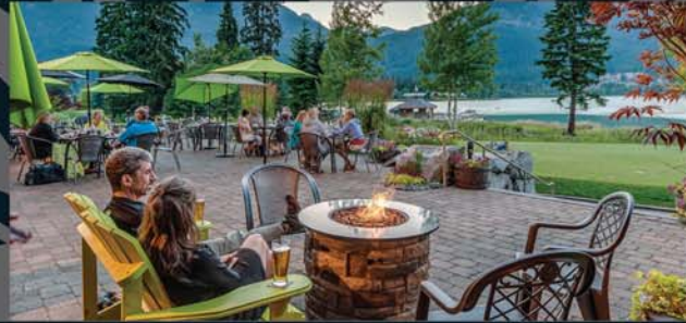
Table Nineteen Lakeside Eatery is open for breakfast, lunch & dinner during golf season, and for dinner in the winter from December through March. The fireplace lounge with 6 HD-TVs is the perfect place to watch all sporting events.

Featuring contemporary clubhouse favourites, casual and fine West Coast cuisine. In the winter we offer elegant fondue dinners, as well as horse drawn sleigh rides along Green Lake and the golf course.