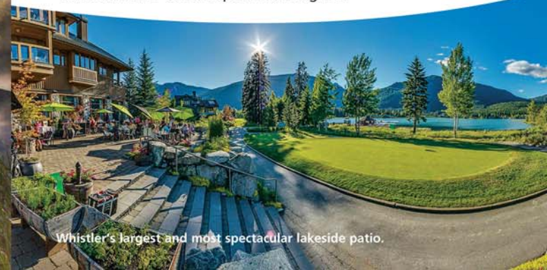
Whistler's largest and most spectacular lakeside patio.

Come visit us... "Come Experience a Legend!"